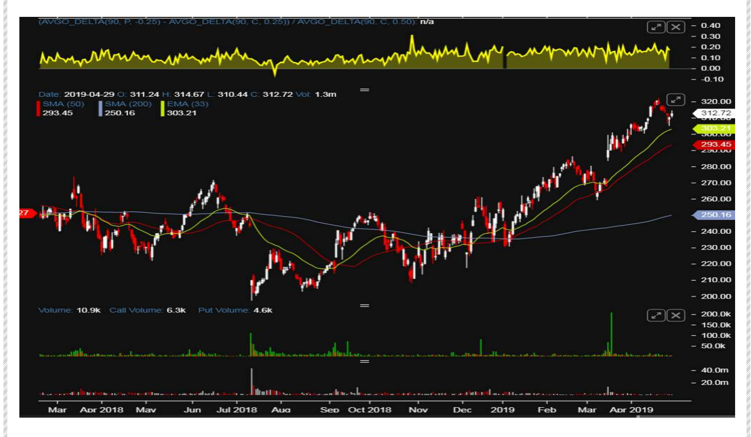
Technical Analysis: AVGO shares with a key trend breakout and now in a rising channel on the weekly with RSI supportive. Shares continue to have a measured move target of $350.